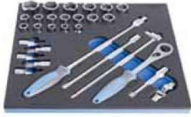
940E 940EV 920PLUS 2/3 374 x 364 x 30