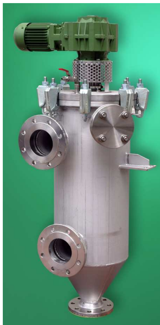
DELTA-STRAIN 600-RS, 1.4571, 10 bar

Automobile industry Chemical industry Electronics industry Paint and lacquer industry Semiconductor industry Cosmetic industry Plastics industry Beverages and food industry Metalworking and steel industry Mineral oil industry Paper industry Pharma industry Water supply and wastewater treatment companies etc.