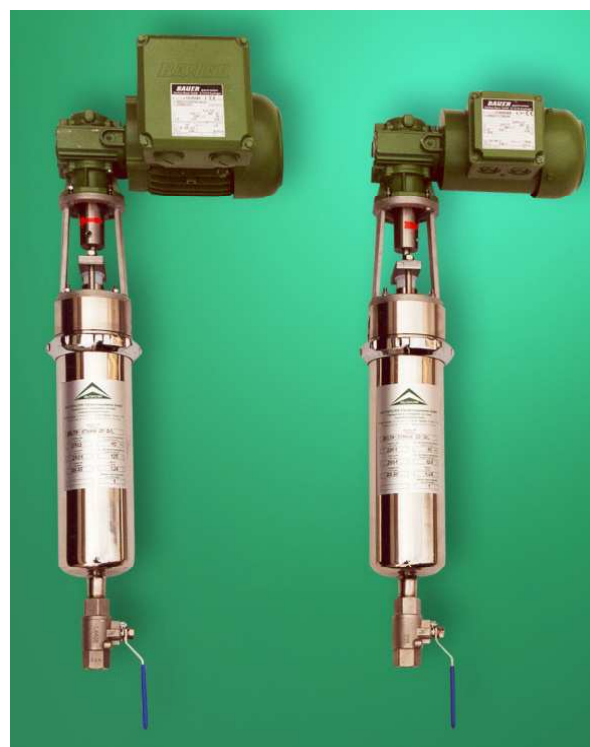
DELTA-STRAIN 35-D/L with EX-proved and normal motor

Electronics industry, Optic industry, Pulp & Paper industry, Leather industry, Steel industry, Wastewater and Water supply companies etc.